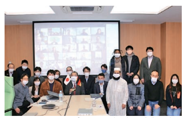
Commemorative photo of all members