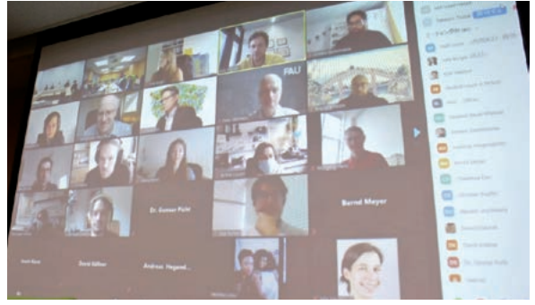
During the seminar